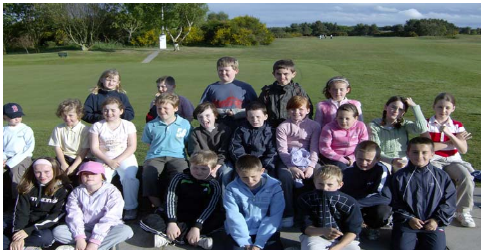
Children at Scotsraig Golf Club

The month of May saw Scotsraig Golf Club begin delivering Stage 1 coaching with children from local schools. A total of 103 Primary 5 children from the schools of Tayport, Newport, Wormit and Balmerino each received an introduction to golf during school time in April through the adaptive game first clubgolf . The sessions in schools were delivered by three Golf Coaching students from Elmwood College who also happen to be members at Scotsraig. The sessions were a great success with the class teachers commenting on how much the children had enjoyed the coaching they received. Each child was given the opportunity to apply to attend clubgolf Stage 1 coaching at the club which teaches the fundamental skills of the game using real golf equipment on a developmental basis. The club were inundated with applications to attend the coaching sessions, which are delivered by members of the club who are PGA Level 1 qualified coaches, and a total of 21 children are now attending on a weekly basis. The initiative has proved a great success with 20% of the children attending coaching at the golf club from insight into the game from school well done to all involved.